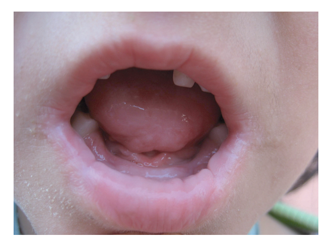
Figure 2. Lack of deciduous teeth