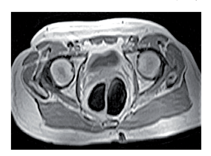
Figure 1. Double lumen view can be seen on MRI incision

than 1 year. In rectal examination a mass, nearly 4x4 cm diameter was determined on posterior rectum wall. Magnetic resonance imaging (MRI) showed rectal diverticulum 5x4 cm in diameter on rectum posterior wall of pelvic (Figure 1). On rectosigmoidoscopy, rectal diverticulum with a narrow opening, which is full with fecaloma was determined on proximal of Linea Dentata of rectum (Figure 2). A fecaloma is removed from rectum endoscopically.