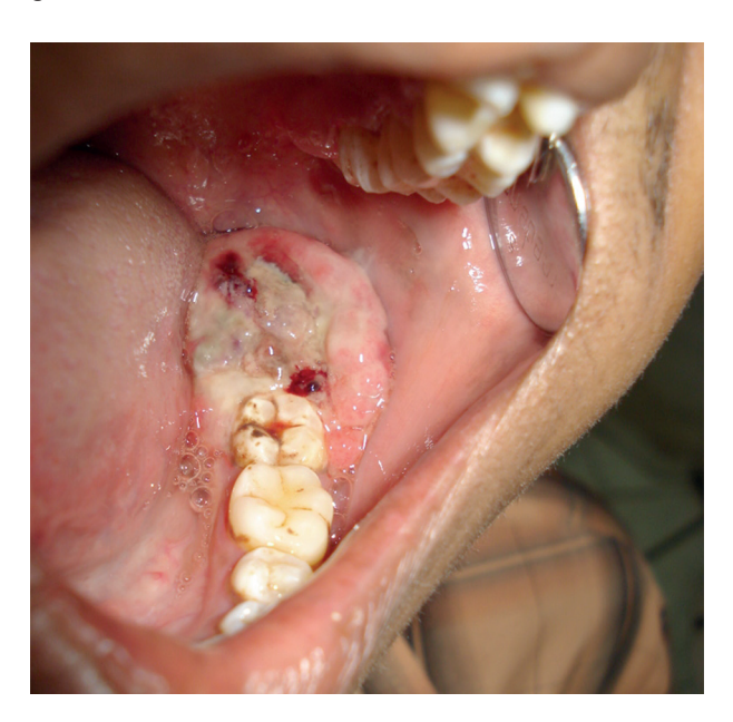
Figure 1. A soft fleshy mass measuring about 3 \times 2 cm in the lower left side in third molar and retromolar region

Extra-oral examination of face showed no obvious abnormality. Intra-oral clinical examination revealed a soft fleshy mass of approximately 3x2 cm in the lower left third molar region extending in the retromolar region (Figure 1). Lateral oblique radiograph of mandible did not reveal any abnormality (Figure 2). Incisional biopsy from the third molar region was taken.