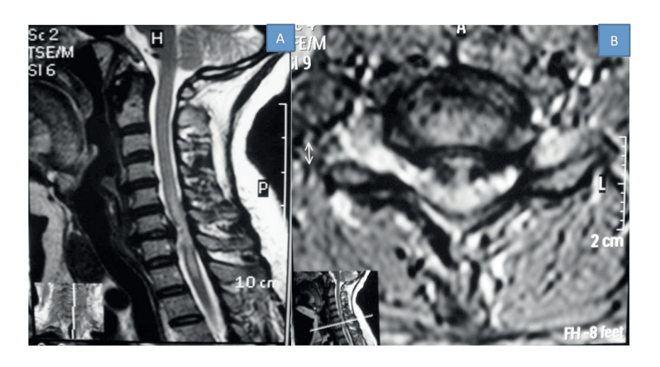
Figure 1. T2 weighted sagittal MRI showing spinal cord edema (A), and T2 weighted axial MRI showing tear in posterior longitudinal ligament and intradural disc herniation (B)

After surgery, the patient was free of complaints, and her motor function was improved soon after in a several weeks by proper rehabilitation.